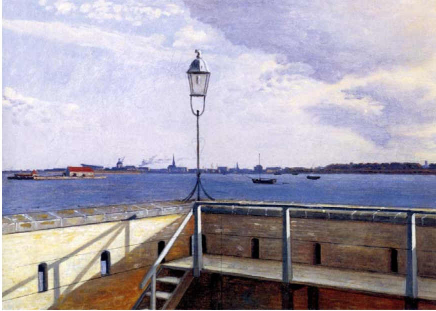
Fig. 1: View from the Battery of Trekroner with Copenhagen in the Distance , 1836, oil on canvas, 21,5 x 30,5 cm. Den Hirschsprungske Samling, Copenhagen