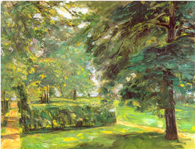
Fig. 2: The Hedge Gardens at Wannsee, looking East , 1924, oil on canvas, 71 x 94 cm, Eberle 1924/36. Galerie Neue Meister, Staatliche Kunstsammlungen Dresden, inv. 71/30.