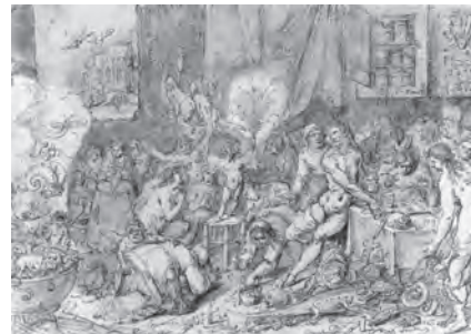
Fig. 2: A Witches' Den , pen and brown ink, brown wash, heightened with gold, 190 x 169 mm. Albertina, Vienna.