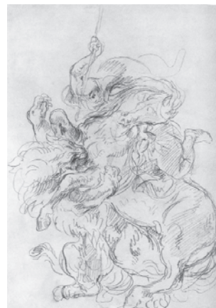
Fig. 2: An Arab on Horseback Attacked by a Lion . 1849.

Graphite on tracing paper, 460 x 305 mm.