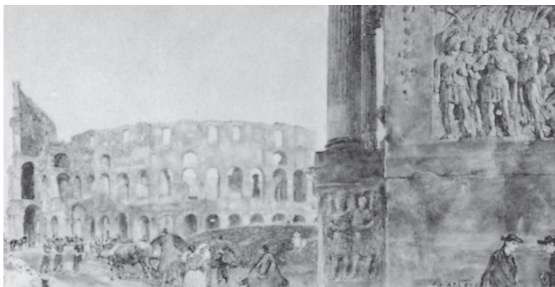
Fig. 1: View of the Coliseum from the Arch of Constantine, Rome.

Alt depicts the Coliseum from an unusual standpoint. The massive outer wall of the building fills the background, almost touching the left edge of the sheet. In the right foreground the block-like structure of a section of the Arch of Constantine with its detached Corinthian column abruptly divides the image. The relief on the side of the Arch, depicted in some detail, is truncated by the right edge of the sheet. This light-filled, painterly image is suffused with varying tones of ochre and brown contrasting effectively with the delicate blue of the sky and the costumes of the two women near the sculpted plinth of the column. The composition is characteristic of Alt's work of the 1860s and 1870s. Achim Gnann comments: In his work of this period he avoids funnel-like perspectives that draw the viewer's eye deeply into the composition. In contrast, the compositions unroll before the eye; they have an extraordinary breadth and expansiveness of vision. His forms become more filigree and more clearly defined, less generalized and are structured in far greater detail. They create a complex mosaic of myriad parts gleaming in the reflection of the soft light that veils them. This light informs objects with a powerful sense of materiality and the atmosphere of one of these calm, sunlit days is captured with extraordinary sensitivity. 2