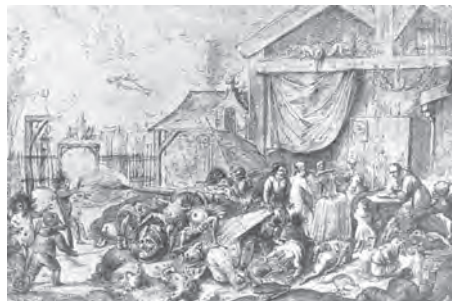
Fig. 1: The Temptation of St. Anthony , pen and brown ink, brown and grey wash, 195 x 292 mm. British Museum, London.

A hand-written inscription on the verso of the present sheet at one time attributed the drawing to Pieter Brueghel III (1589 - c.1640), known as 'Hell' Brueghel. The masterly handling of the depiction of the inhabitants of Hell would seem to have supported this attribution. Similar figures of horror populate Francken's autograph drawing in the British Museum in London. This too depicts