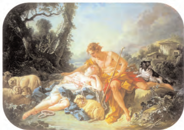
Fig. 2: Daphnis and Chloe ( Shepherd watching a Sleeping Shepherdess ). Oil on canvas, 109.5 x 154.8 cm. Wallace Collection, London.

The focus of the present drawing is entirely on the body of the sleeping Chloe. The passive, sensuous figure of a female nude oblivious of her audience was one of Boucher's preferred themes. The sheet is entirely characteristic of his female studies of the period. The composition, the pictorial qualities and the high finish of this drawing would have greatly appealed to his patrons, suggesting that the artist's intention may have been to offer it to a collector as a framed work in its own right. Boucher first presented similar drawings at the Salon in 1748.