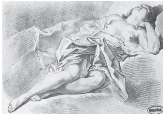
Fig. 1: Louis-Marin Bonnet (after Boucher), La Dormeuse . Engraving.

This fine drawing of a sleeping girl is directly related to Boucher's painting Daphnis and Chloe ( Shepherd watching a Sleeping Shepherdess ), signed and dated 1743, now in the Wallace Collection, London [fig. 2]. 2 The subject of both the present drawing and the painting is based on an incident in Longus's pastoral romance Daphnis and Chloe . The painting combines one of the erotic highlights of classical literature with the sentimentality of pastoral romance. In the scene, Chloe falls asleep in the noonday shade to the sound of Daphnis's pipes. Noticing her slumbers, Daphnis sets down his pipes and devours her with his eyes.