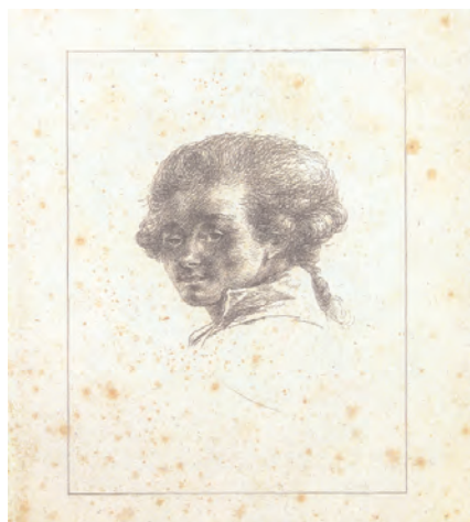
Fig. 1: Self-Portrait . Etching, c.1780.

The present drawing corresponds very precisely to Denon's etching, Self-Portrait (fig. 1), 2 but in reverse. That the sheet was directly preparatory to the etching seems likely. However, in the etching the image is reduced to the head alone. According to La Fizelière, 3 the etching was executed around 1780 after a pastel by Noël Hallé (1711-81), under whom Denon had studied in 1761-3. It is likely that the pastel dates from the same period. Now lost, it was evidently owned by Denon as it is listed under lot 758 of his estate sale (1 May 1826) with the following description: le portrait de M. Denon dans sa jeunesse; il est en buste et de trois quarts; ce portrait est exécuté aux pastels fixes. 4 However, Marie-Anne Dupuy-Vachey sees no evidence to support the theory that Denon's etching might be derived from Hallé's pastel. The existence of the present Self-Portrait makes her scepticism all the more plausible. 5