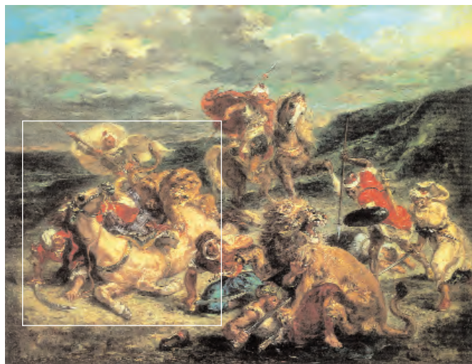
Fig. 1: Lion Hunt . 1861.

This drawing is a preparatory study for Delacroix's painting Lion Hunt , executed in 1861. Regarded as one of the masterpieces of his late period, the painting is now in the Art Institute of Chicago [fig. 1]. 1 It depicts hunters and wild cats embroiled in a fierce and life-threatening battle of uncertain outcome. The action can be grouped into four areas, all of which combine to form a dynamic centrifugal composition. On the left a lioness leaps from the rear onto a fallen horse while its rider looks over his shoulder in dismay as he tumbles. In the present sheet, this group appears twice – on the left in a rapid and spirited sketch and on the right as a finished study. 2