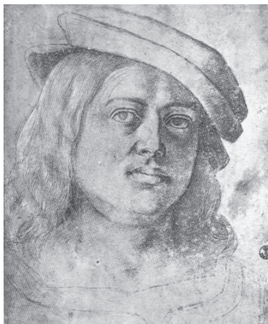
Fig. 1: School of Ferrara, 15 th century, Head of a Nobleman Wearing a Cap . Silverpoint on pink prepared paper, 209 x 177 mm. Uffizi, Florence.

The authenticity of the drawing has been confirmed by Theodore Reff and François Lorenceau.