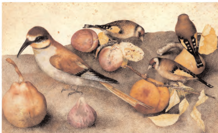
Fig. 1: Giovanna Garzoni, Still Life with Fruit and Birds . C.1650. Gouache on vellum, 251 x 416 mm. The Cleveland Museum of Art, Cleveland.

Orchards had become fashionable in courtly garden design in Italy in the second half of the sixteenth century. Scientific research and illustration greatly interested those who were active in the life of the courts. As a result, images of natura sospesa [nature suspended] came into vogue. 1 One of the many tasks of Ferdinando II's efficient administration was to provide artists with models from life: fresh flowers and fruit, and live animals. Even if each painter had his or her own set of models – and Giovanna Garzoni belonged to that tradition – what made these images so vibrant was the presence of freshly gathered plants with their roots and flowers. 2 Garzoni's skilful depictions of natural objects arranged in pleasing ensembles caused the paintings to be fiercely coveted by wealthy patrons.