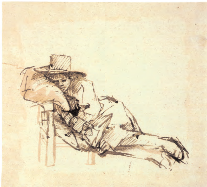
Fig. 1: A Young Man in a high-crowned Hat, asleep , pen and brown ink and wash. British Museum, London.

Peter Schatborn has proposed an alternative attribution to Johannes Leupenius (1643 - Amsterdam - 1693), who was also a pupil of Rembrandt. On stylistic grounds he compares the present sheet with studies by Leupenius in Berlin, Paris and Oxford. 8