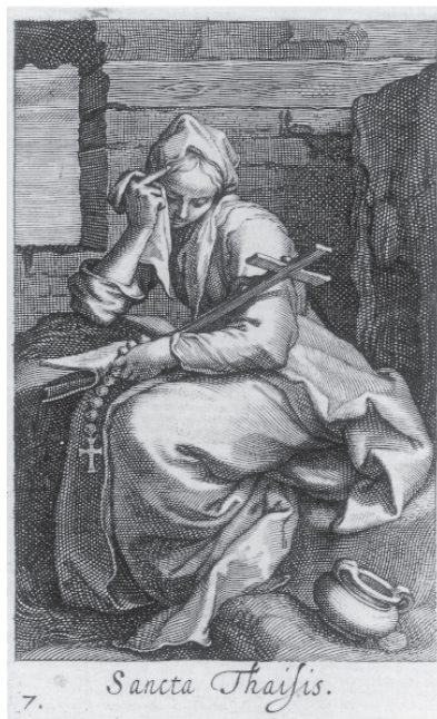
Fig. 1: Schelte Adams Bolswert, Sancta Thaisis . Engraving, 1612.

Several related works are known. A drawing after the sheet is in the Joseph McCrindle collection, New York, 7 while a second copy is in the collection of the Nationalmuseum, Stockholm. 8