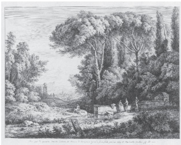
Fig. 1: Paysage . 1804. Etching with drypoint and roulette. (Pérez 125).

Freed from any compositional concerns, Boissieu reveals himself as an excellent interpreter of his model. He uses a characteristically reduced palette in subtly nuanced shades of grey. His style of execution is remarkably free and he adapts his brushwork with extraordinary versatility to capture the complexities of textural detail and the distinctive features of the landscape. This is particularly evident in his handling of the powerful contrasts created by the interplay of brightness and deep shadow in the foliage. 2