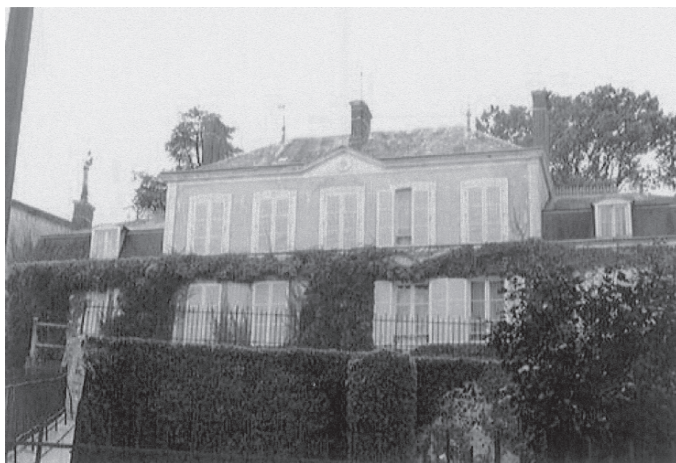
Fig. 1: La Tremellerie , Saint-Privé on the river Loing in 2003.

A watercolour dated 1885 depicting the same area is in a private collection, New York. 2