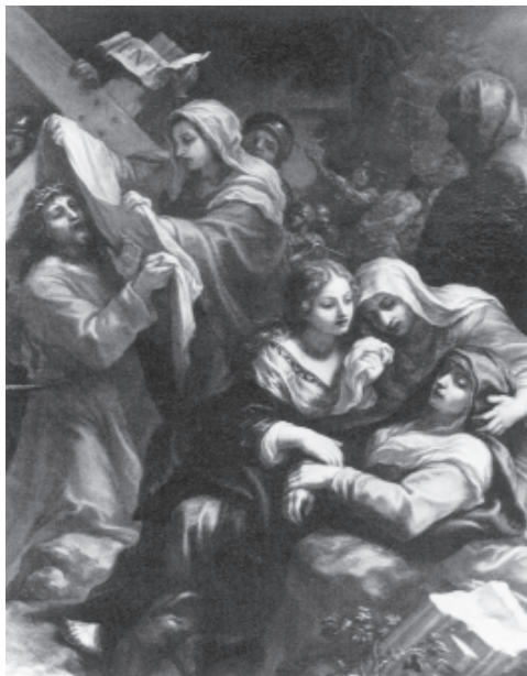
Fig. 1: Christ on the Road to Calvary . Oil on canvas. Marchesi Gerini collection, Florence.

The studies on the recto and verso of the present sheet are preparatory for Franceschini's famous altarpiece Christ on the Road to Calvary , now in the Marchesi Gerini collection in Florence [fig. 1]. 1 The main figure on the recto is a study for the head of St. Veronica. In the finished painting the Saint is depicted lifting the sudarium , or cloth, from the face of Christ. This act of devotion, although entirely apocryphal, is an incident associated with the Road to Calvary. Tradition has it that the sudarium was imprinted with the image of Christ's face. The four drawings of hands at the right of the sheet are preparatory for the same figure. Two drapery studies immediately beneath St. Veronica are studies for the cloak of the Virgin who is depicted at the lower right of the painting.